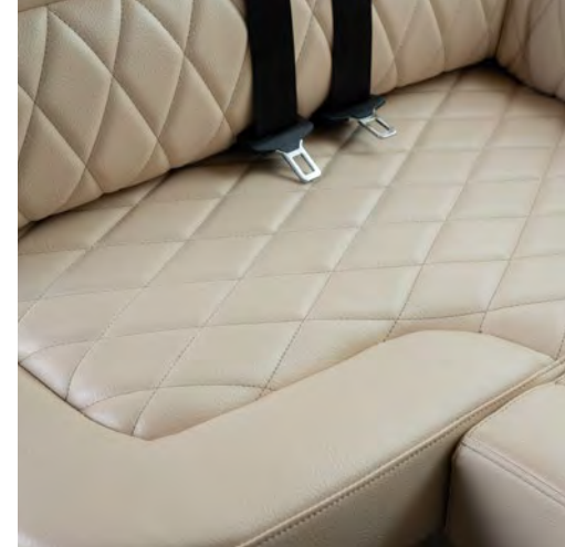
EMBROIDERED FAUX LEATHER